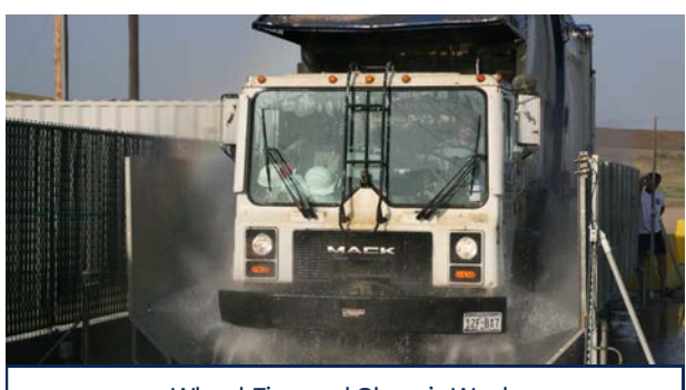
Wheel, Tire, and Chassis Wash

This heavy-duty, automatic rollover wash system uses high-pressure water to effectively remove debris, yard waste, caked on mud, and more. It is perfect for cleaning various vehicle shapes and an excellent solution for waste management fleets. The system uses solid-stream nozzles to apply high-pressure cleaning on the top, sides, front, and rear surfaces of vehicles. It can wash both small and large vehicles in under 5 minutes.