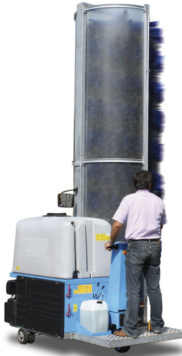
OPTIONAL: With operator on board