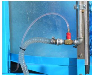
Automatic Detergent Dispensing Device