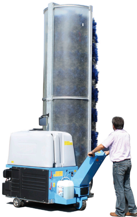
Operated from the ground