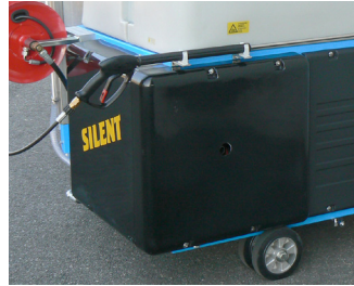
Silencer Unit for Diesel Engine