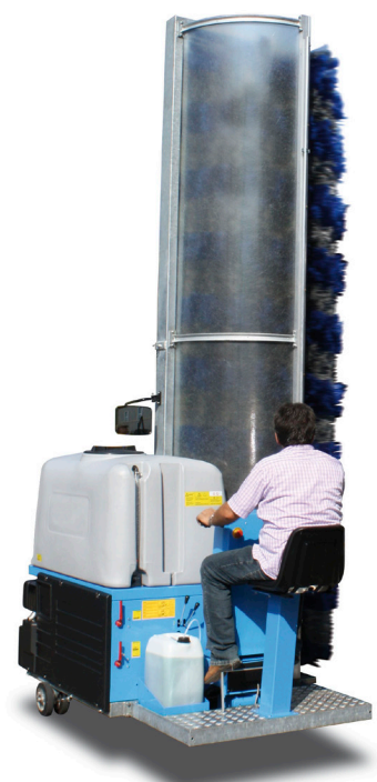
OPTIONAL: With seat for operator on board