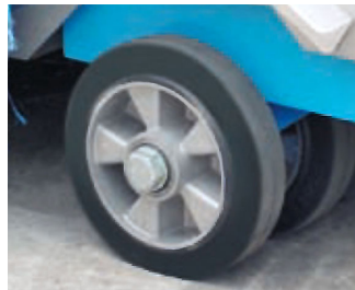
Twin Wheels for Greater Stability