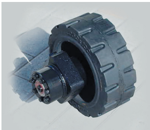
Hydraulic Traction with Variable Speed