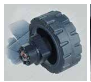
Hydraulic Traction with Variable Speed