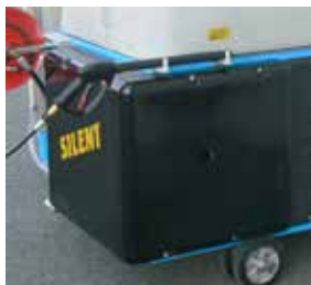
Silencer Unit for Diesel Engine