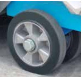
Twin Wheels for Greater Stability