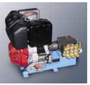
Motor With High Pressure Pump