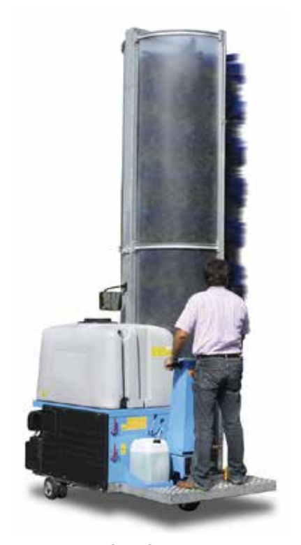
OPTIONAL: With operator on board