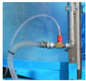
Automatic Detergent Dispensing Device