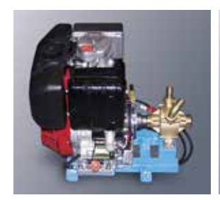
Diesel Motor Unit