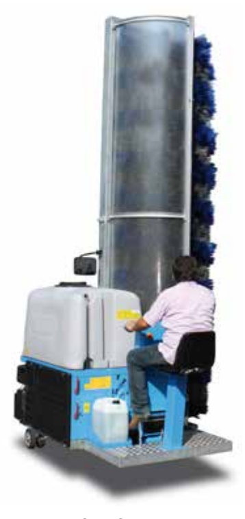
OPTIONAL: With seat for operator on board