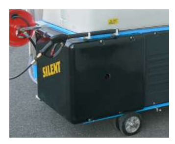
Silencer Unit for Diesel Engine