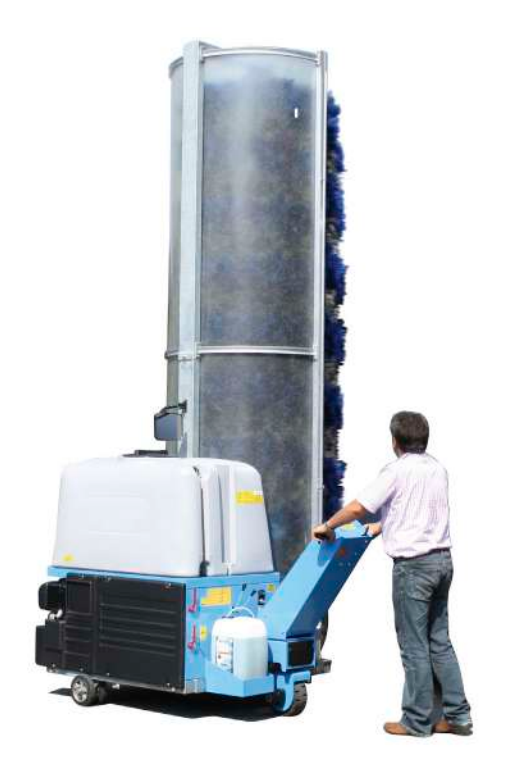
Operated from the ground