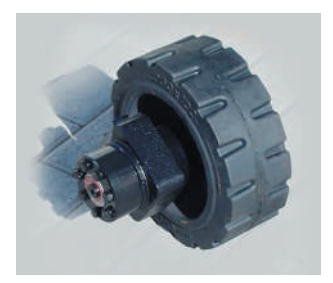
Hydraulic Traction with Variable Speed