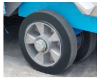
Twin Wheels for Greater Stability