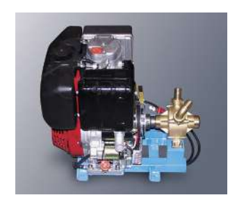
Diesel Motor Unit