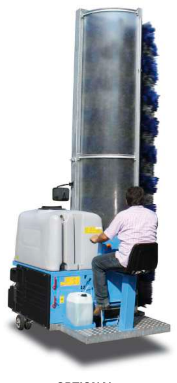
OPTIONAL: With seat for operator on board