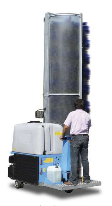
OPTIONAL: With operator on board